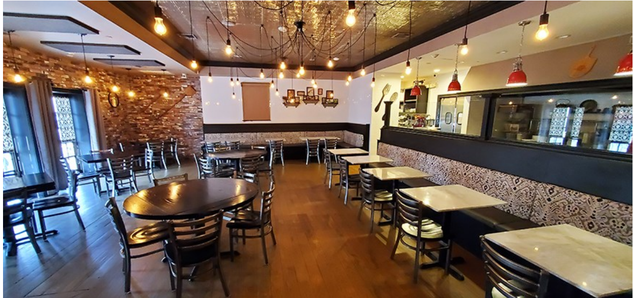
Rich Finishes – Dedicated Gourmet Pizza Station – Large Covered Dining Patio

Seating – 56 Main – 30 Back Room – 15 Bar – 80 Patio