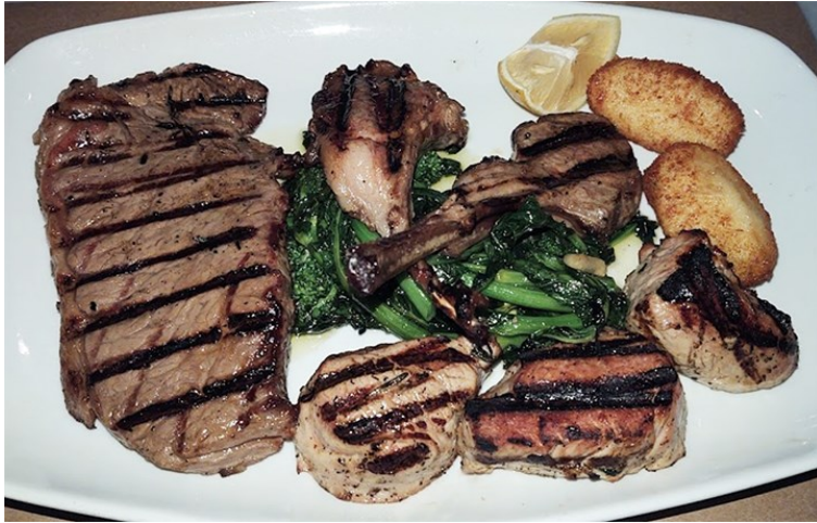
Wines on Tap