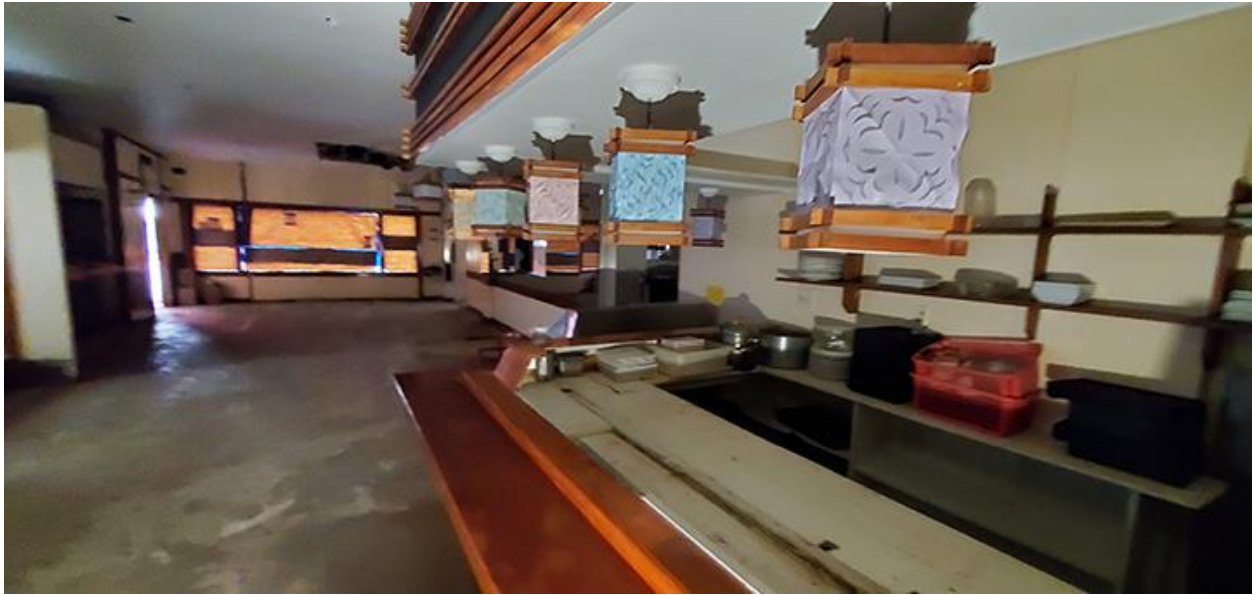
Former Main Room