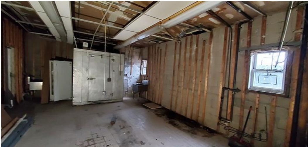
Former Kitchen Space