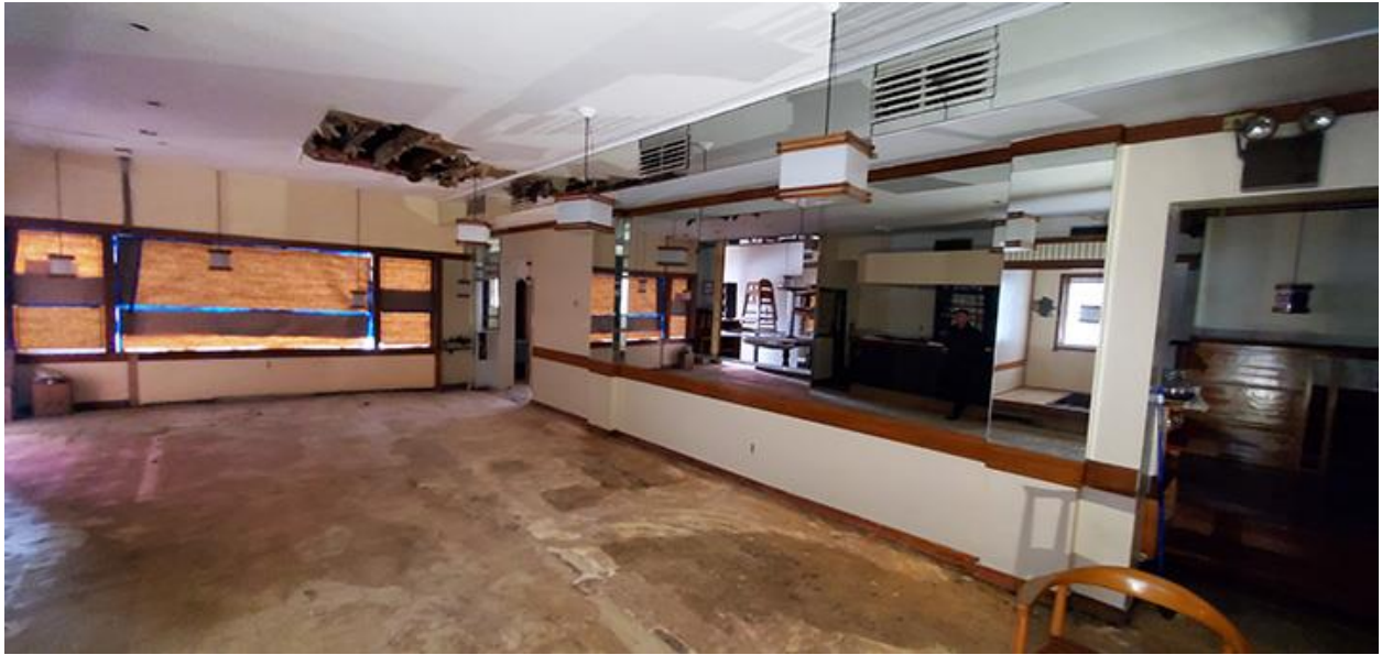
Main Room with Mirrors