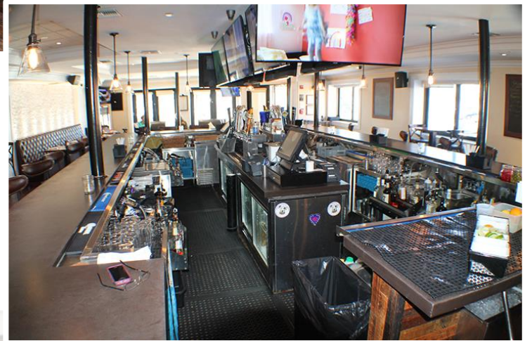
Well Equipped Stations