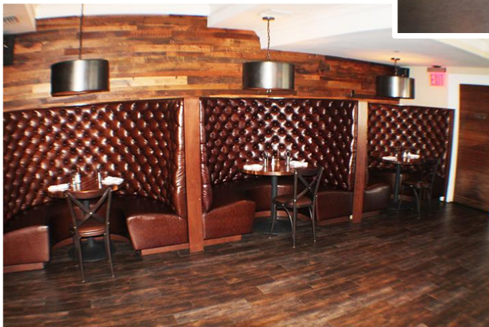
Bar Room Six-Tops