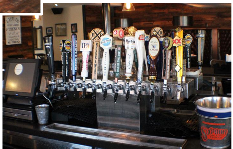
Selection of Tap Beers