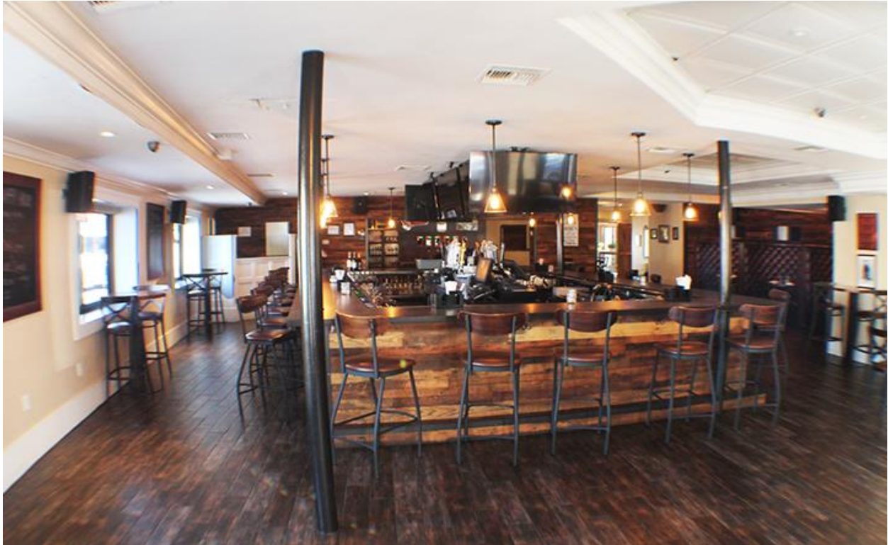
Bar Room with Dining Tables and Banquette.

Location just One Block from the Boardwalk & Ocean