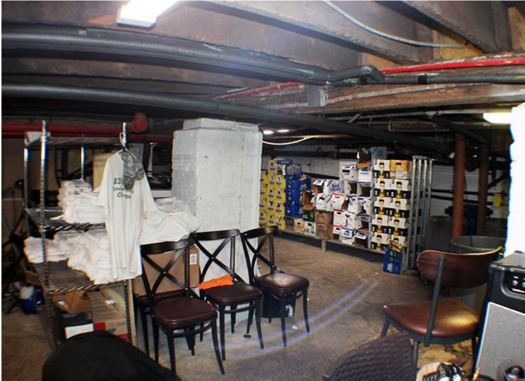
Basement Backup & Storage