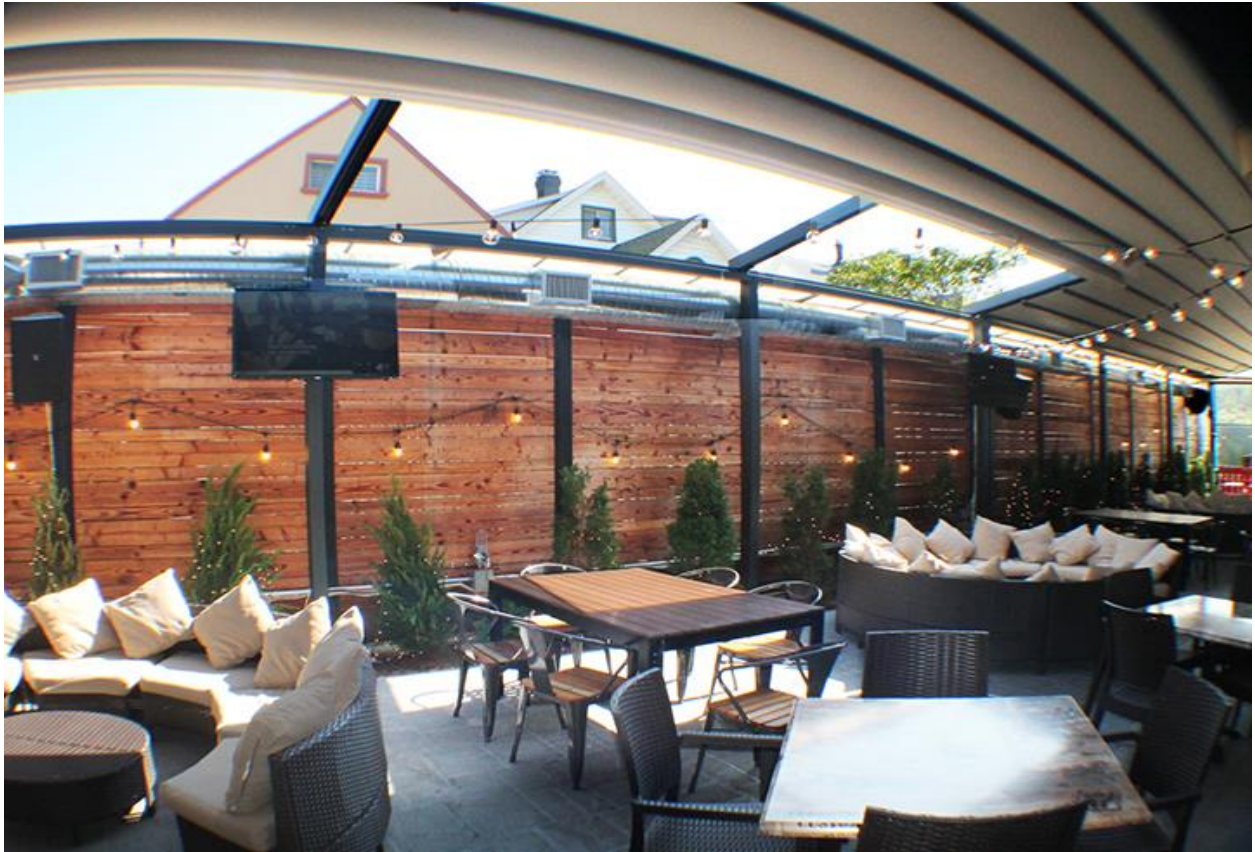
Operable Patio Roof – Heated and Air Conditioned