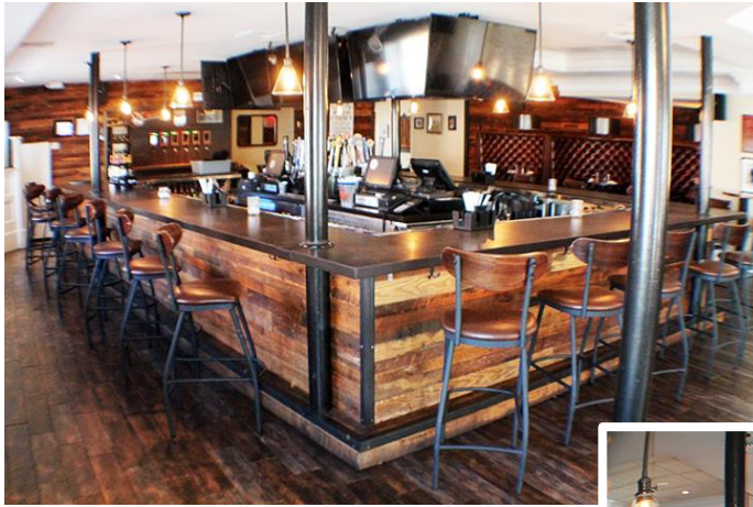
Three Sided Bar