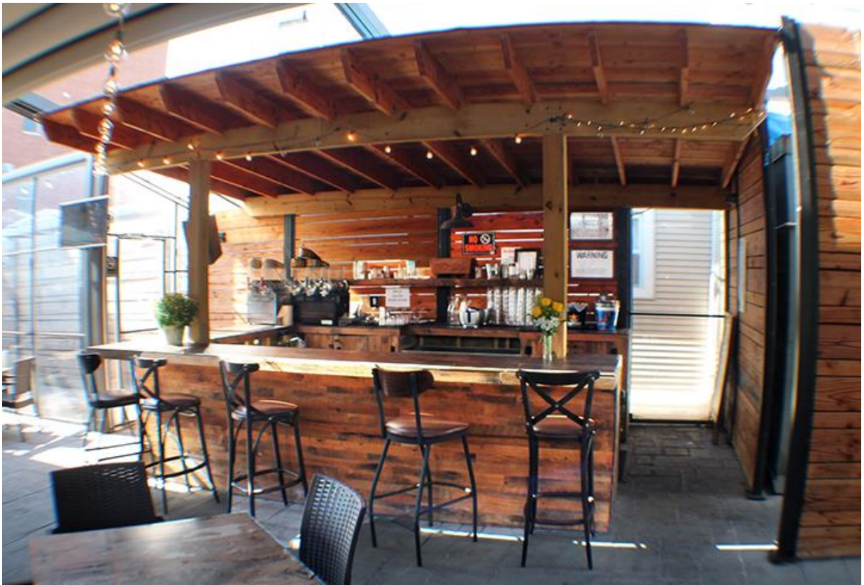
Patio Bar and Seating