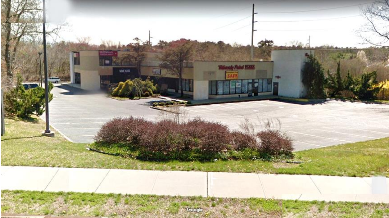
New Landscaping – Restriped Parking Lot – Well Maintained Center

Fully Leased – Well Seasoned Tenants – 620 Waverly Ave., Patchogue, NY