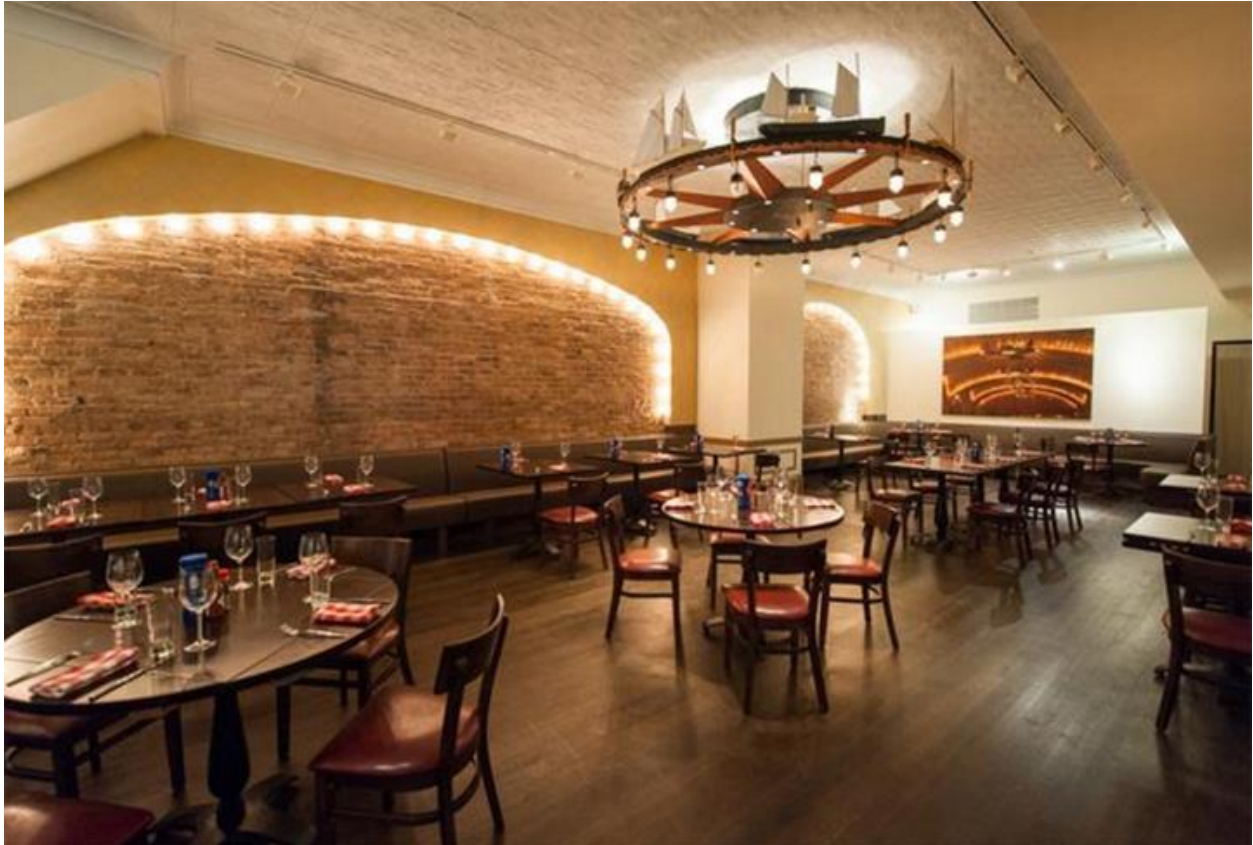
Two Dining Rooms + Exhibition Kitchen and Dining Bar

Rent just $40/SF. = $18,025 per month + 3% each 2 years