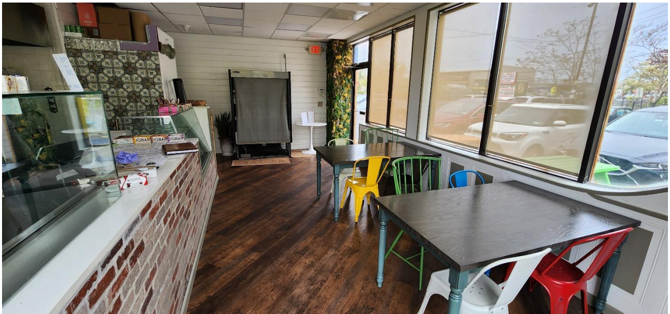
New 12' Hood and Fully Equipped Kitchen