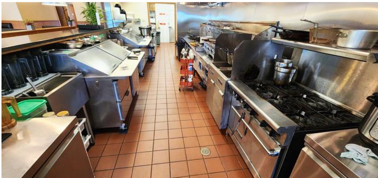
Spacious Exhibition Kitchen