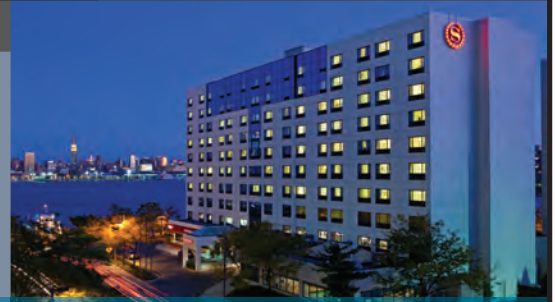
SHERATON HOTEL IN FOREGROUND