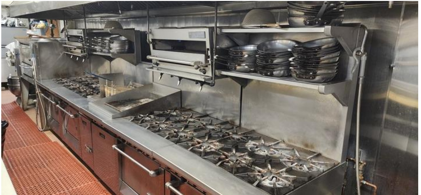
First Class Chef's Kitchen