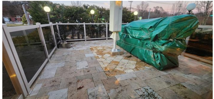
Outdoor Dining Patio for 30