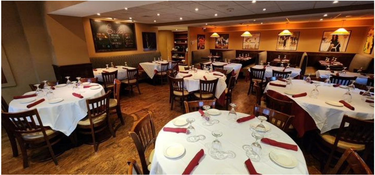
Main Dining Room