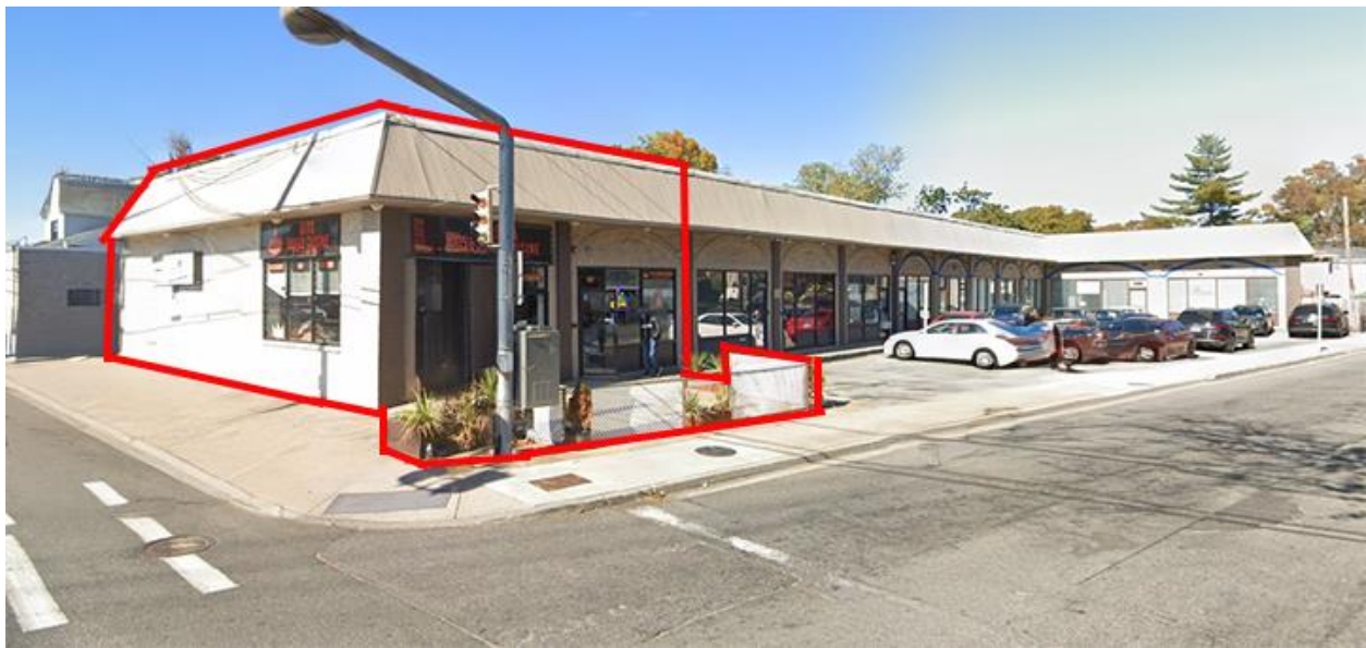
45 Indoor Seats Plus Outdoor Dining Patio