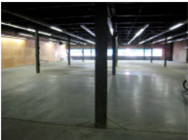
Ground Floor Space