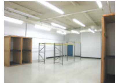
Finished Second Floor