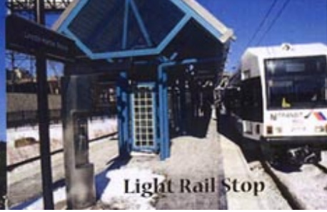
Light Rail Stop