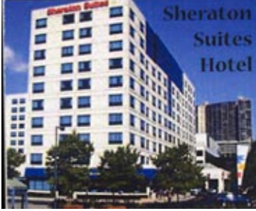
Sheraton Suites Hotel