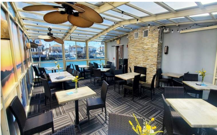
Deck with Retractable Roof