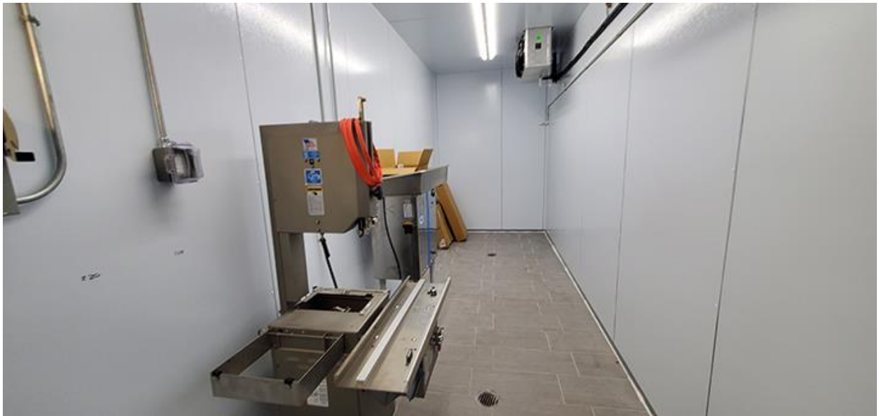
New Buildout, New Kitchen, Never Used Equipment