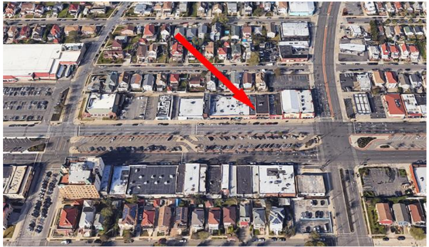
Walk In Refrigeration – 7' x 24'