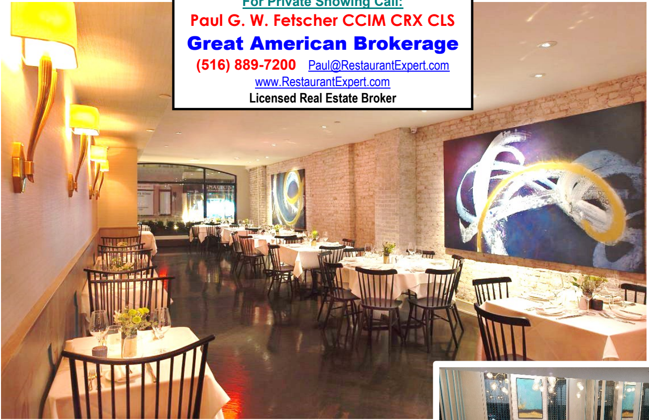
Beautiful Design with Attention to Every Detail