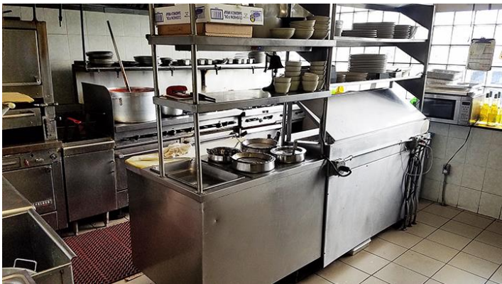
Full Kitchen & Prep Area