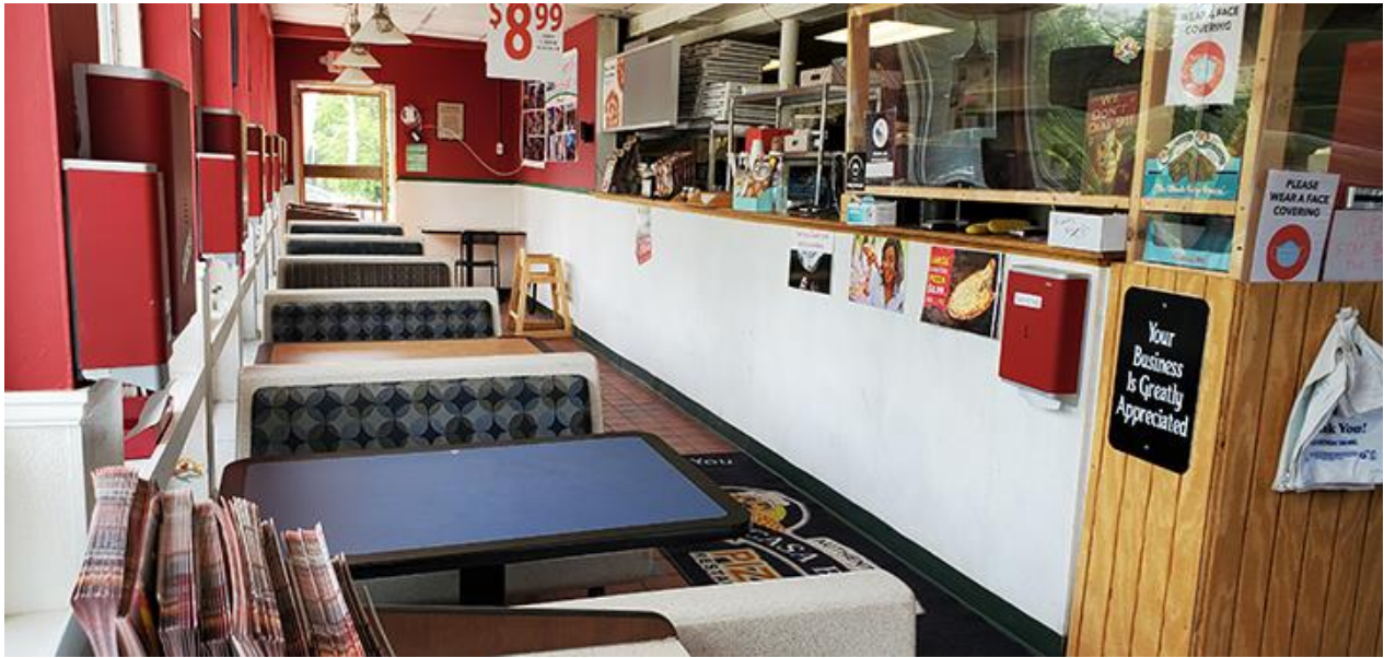
Indoor and Outdoor Seating – Full Kitchen