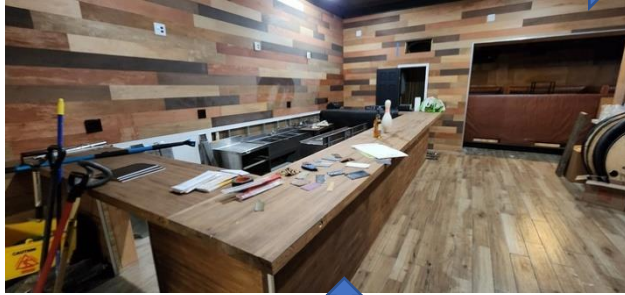
Redecorated Bar Room