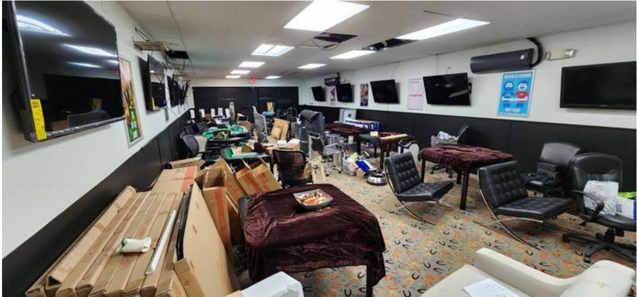
Separate Party Room